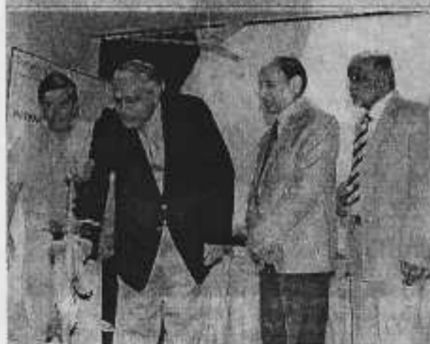
General Manager, South Eastern Railway lighting the lamp at a three-day Workshop in Plastic Surgery at S.E. Railway I, Garden Reach on January 14

raised the medical. About 40 surgeries will be performed after screening examination of